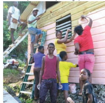
Youth in service.

Many of the young persons who have been involved in Bible