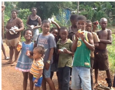
Toys from Randolph get smiles in Jamaica

Conducting free mobile medical clinics is the bulk of the ministry outreach of TEAMS. The clinics are held in local churches as an extension of their evangelism outreach. TEAMS also assists the churches outreach by constructing small homes for the indigent. We use the local church to guide us to needs in the community and then partner with them to help follow up with the spiritual needs of the family.